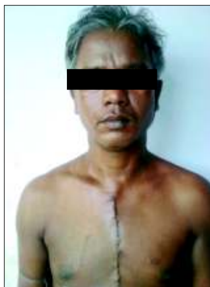
Fig-1: MG patient with standard median trans-sternal thoracotomy scar.

For these complaints he consulted a long list of physicians and surgeons including general physician, internist, orthopedic surgeon, ENT specialist who prescribed him several types of medications including vitamins, minerals, NSAIDs, Muscle relaxants, antibiotics, antidepressants. But his condition did not improve and lastly he started to take indigenous medications.