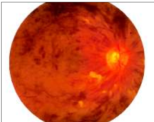
Fig-1: Fundus photography of the right eye,

SUMAIYA SULTANA BINTE MOSHARRAF 1 , MAHMUDUR RAHMAN SIDDIQUI 2 , MD SHAHRIAR MAHBUB 2