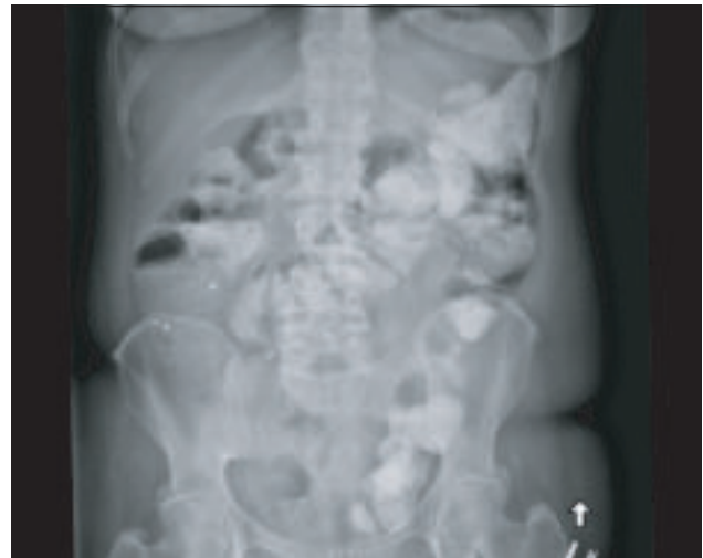
Fig.-4: Showing marked improvement in the degree of bowel dilatation

During the current ED visit, investigations were reported as follows, sodium 133, potassium 3.4, chloride 98, \text{HCO}_3^- 27, urea 1.6, creatinine 53, WBC 17.2, hemoglobin 132, platelets 389, ESR 2, CRP 17, lactate 2.2, stool for clostridial difficile, cultures and O&P were all negative. Blood cultures were negative. Abdominal X-ray (Fig.-2) showed dilated bowel loops and multiple air fluid levels especially on the right side. The general surgery team was consulted; their assessment concluded that the patient had a non-surgical abdomen, unlikely to be mechanically obstructed given the benign physical examination. The patient was admitted and a nasogastric tube was inserted which drained 500 ml of bilious fluid. The patient was kept nil per mouth and a colonoscopy was organized. Abdominal x-rays were repeated (Fig.-3) and showed again multiple dilated bowel loops and multiple air fluid levels consistent with small and large bowel obstruction.