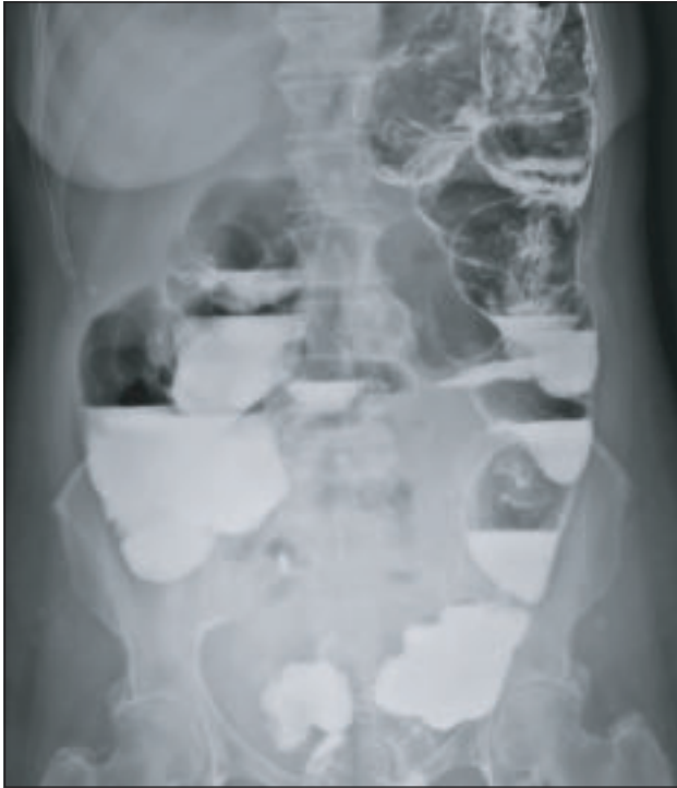
Fig.-3 : Multiple dilated bowel loops and multiple air fluid levels consistent with small and large bowel obstruction

disability. On physical examination, the abdomen appeared distended; on palpation there were no signs of peritonitis, bowel sounds heard on auscultation and percussion revealed diffuse tympany. The patient had been seen in the ER 3 weeks earlier for abdominal pain and a CT abdomen was done at that time to rule out appendicitis (Fig.-1); It showed marked thickening in the wall of the terminal ileum with no small bowel dilatation. A large fecal load in colon was noted. Infectious work-up was done at that time and was negative and the patient was sent back to RMH.