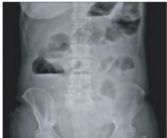
Fig.-2 : Shwing dilated bowel loops and multiple air fluid levels