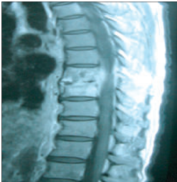
Fig-2: Showing reduction of disc space with paravertebral soft tissue.