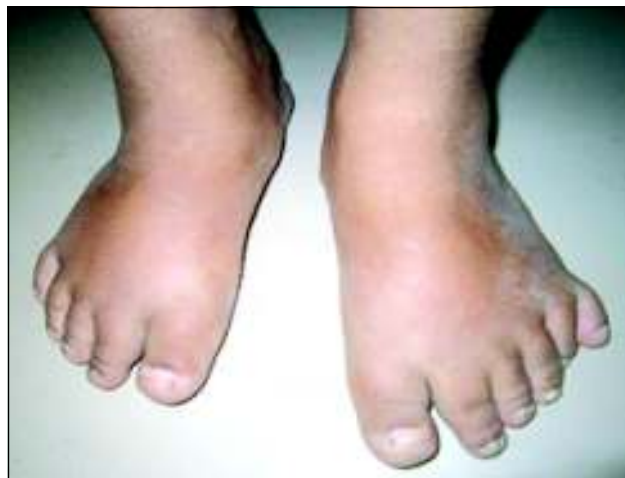
Fig-3: Polydactyly (Left foot)

On examination, she was found to be obese (BMI: 33.3 kg/m 2 ) (Ht-1.45 m, wt-70 kg) of truncal type, short statured. There was generalized edema with crackles in both lung fields with normal precordium. The blood pressure was 140/80 mm of Hg with regular pulse and normal jugular venous pressure.