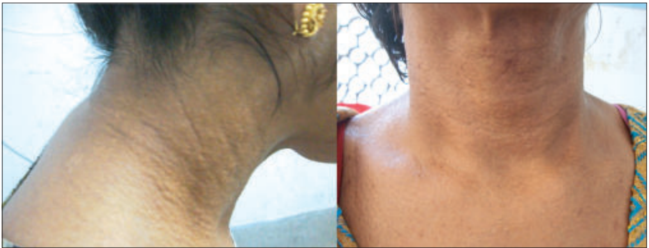
Fig: 1(a & b): Yellowish papular lesion and indurated plaques with transverse creases in neck

Normal, Echo- normal, CT scan of brain - Lt sided old cerebral infarct, MRI of brain-Encephalomalacic changes in Lt parietal region, urine routine microscopic examination revealed- colour –straw, sugar-nil, phosphate- nil Pus cell-1-2/HPF, RBC-1-2/HPF, Casts & crystals –Absent. USG of whole abdomen- suggestive of nephrocalcinosis with normal other finding. Skin biopsy revealed that the reticular dermis reveals numerous elastic fibres with intervening calcification. The epidermis is unremarkable. The elastic fibres were swollen, clumped and stained basophilic with haematoxylin and eosin (H&E) (Fig. 2a). Von Kossa stain confirmed calcification of elastic fibres (Fig. 2b). So, our final diagnosis was PseudoxanthomaElasticum with Bilateral Nephrocalcinosis with Encephalomalacia with Chronic Tension Headache.