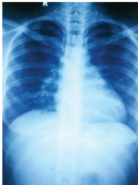
Fig. 1: Radiograph of chest shows no evidence of infection.

Clinical examination revealed severe pallor, mild jaundice, hepatosplenomegaly and examination of fundus showed, number of Roth's spots, hemorrhages and bilateral papilloedema, without lymphadenopathy or any other evidence of infection.