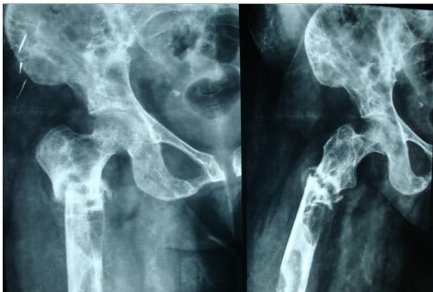
Fig.-2: Multiple osteolytic lesions with fracture in shaft of right femur

Radiological survey revealed gross osteopenia, punched out osteolytic lesion and fractures (Figures 1 & 2). CT scan, MRI of the neck and parathyroid scintigraphy were unremarkable.