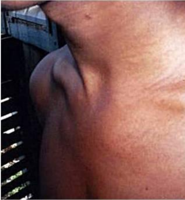
Fig-1: Swelling on left sternoclavicular joint

features of epithelioid granuloma with some caseation suggestive of tuberculous lesion (Figure 2 & 3) Gram stain and cultures were normal. Sputum examination was done which was within normal limit. Mantoux test was positive and tests for immunocompromised status (HIV) were negative. He was started on four drugs anti-TB drugs (ATD) — rifampicin, isoniazid, ethambutal and pyrizinaide. Within a period of 2 month his symptoms improved and the swelling of left sternoclavicular joint had subsided. The patient was advised to complete the course of ATD and had complete response with no residual impairment.