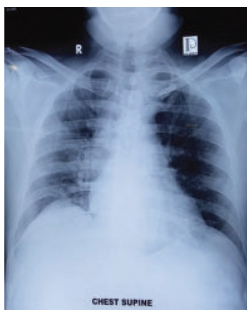
CXR done on 14 th day of disease