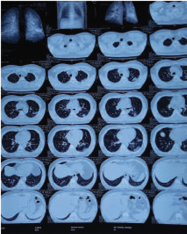
HRCT chest on 16 th day of disease

But as patient's wellbeing was improved and considering risk of overwhelming secondary infection, Tocilizumab was not given. Gradually patient's oxygen demand decreased, and inflammatory markers were also reduced. On 14 th day of hospital admission patient was doing fine without oxygen and was discharged.