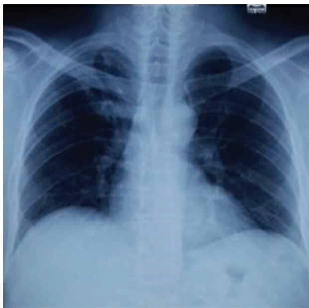
Figure 3: CXR PA view.

CXR P/A revealed fibrous band opacities are seen in right upper zone (Figure 3). Whereas CT guided FNAC from right lung lesion revealed chronic inflammatory lesion.