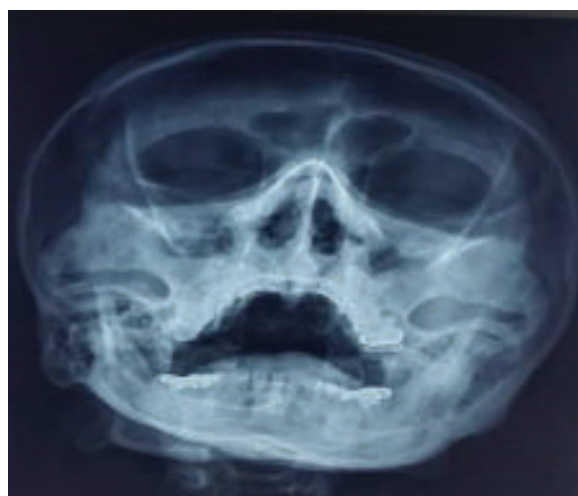
Figure 2: X ray PNS OM view

His X-Ray PNS OM view revealed maxillary sinusitis with hypertrophied inferior turbinate. (figure-2)