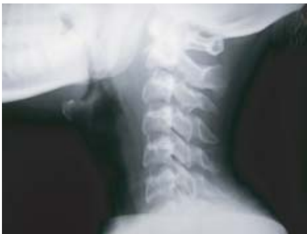
Fig-1: Normal finding on X-ray cervical spine lateral view

On investigation, Hb-12.6g/dl, ESR-50 mm 1 st hour, total count -65000/mm 3 , neutrophils-58%, lymphocyte-36%. Total platelet count-290000/mm 3 , X-Ray of neck (both view) normal (Figure 1). Chest X-ray was normal. MRI of dorsal spine shows retropharyngeal abscess with epidural extension resulting in corresponding spinal cord compression and compressive myelopathy (Figure 2). Consultation with an ENT specialist was done and exploratoion and drainage was undertaken. A large pocket of pus was present behind the sternocleidomastoid muscle medial to the internal jugular vein. The pus was drained and sent for microbiologic examination. On an acid-fast smear, Mycobacterium tuberculosis bacilli were identified. Biopsy of tissue from posterior pharyngeal wall showed granulomatous inflammation with caseous necrosis consistent with TB. A diagnosis of Pott's disease was established, and the patient was started on antituberculous therapy. She improved rapidly over the next few days. Her neck stiffness decreased and she was able to eat comfortably. But her quadriplegia had poor improvement initially. At second week she started to show improvement with gradual movement of limbs and regaining of sensation. She was discharged with advice of anti TB drug for one year duration with steroid coverage.