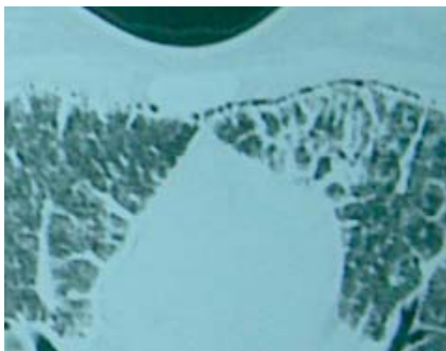
Fig.-3: Black pleura sign