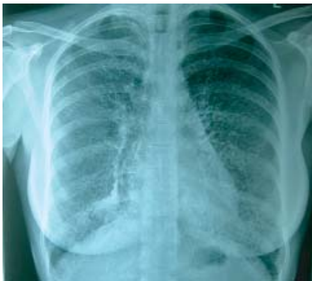
Fig-1. Bilateral diffuse nodular opacities

calcification. 8 In fiberoptic bronchoscopy, the endobronchial appearance was normal. Bronchial lavage fluid was examined for tuberculosis and found as negative. She underwent CT guided biopsy of the lung tissue and the histopathological report came as calcium deposition in the alveoli which confirmed the diagnosis of pulmonary alveolar microlithiasis. In view of the familial association of this disease, sister and the brother of our patient (21 and 19 years old, respectively) were invited for chest radiographies. No abnormalities were detected in the X-rays of the siblings.