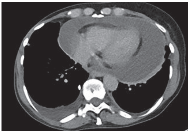
Figure 2: CT abdomen showing large circumferential pericardial effusion with fluid at the apex measuring 3.5cm

The echocardiogram revealed a large circumferential pericardial effusion with evidence of cardiac tamponade including right atrial systolic collapse and focal strands; as well as a dilated IVC and hepatic veins ( Image 3 ). The patient was admitted to the ICU for further management of cardiac tamponade. Etiology at the time was unclear, thought to be most likely secondary to malignancy. Initial treatment included fluid resuscitation, pericardiocentesis fluid analysis, and further labs including normal TSH. Pericardiocentesis was done with a pericardial drain placed for further drainage. The procedure revealed a large hemorrhagic pericardial effusion draining 900 mL of red fluid. No pericardial tissue was taken for analysis. Pericardial fluid analysis revealed