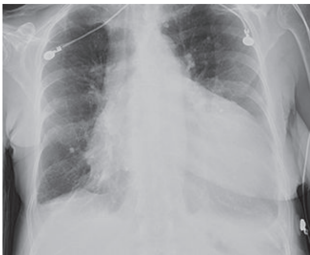
Figure 1: Chest X-ray revealing large pericardial effusion and small bilateral pleural effusions.

massive pericardial effusion and small bilateral pleural effusions ( Image 1 ). CT of her abdomen showed no small bowel obstruction but did show a massive pericardial effusion plus ascites ( Image 2 ).