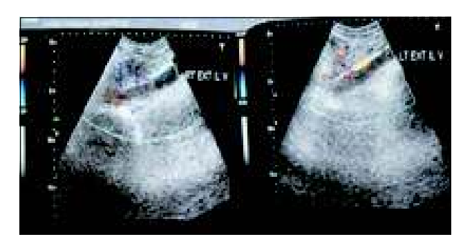
Fig-2: Colour doppler study of thigh showing involvement of both external iliac veins by extensive sub-acute thrombus.

switched on to warfarin (starting dose 5 mg) with maintenance of international normalized ratio (INR) between 2.5 to 3. Rifampicin was withdrawn and injection streptomycin 750 mg daily was added in the regimen. A repeat Doppler study after three months of treatment with anticoagulant showed absence of thrombus with normal flowed phasic variation with inspiration and augmentation with distal compression (Fig.-2).