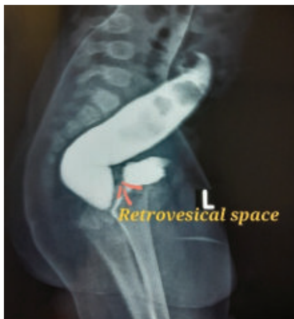
Fig.-3: The retro vesical space allows enough space for dissection without injuring the urogenital tract

The authors practice a modified technique of PSARP, where the rectum is mobilized first proximally and then posterior to the bladder (retro vesical space) circumferentially. At this level, there is no longer a common wall with the urethra (Fig.-3).