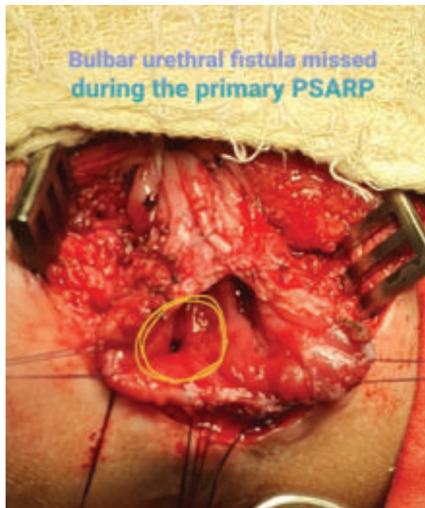
Fig.-1: Posterior sagittal approach to repair a persistent RUF

The posterior sagittal approach, originally described as the definite reconstructive procedure of ARM with RUF, has been reported to achieve successful outcomes in most series. The benefits of this approach are excellent exposure of the whole anatomy, complete separation of the rectum from the urethra, mobilization of the rectum to leave a healthy rectal wall over the urethra, correction of associated anal pathology (e.g., stenosis, mislocation) and urethral stenosis but one should expect dense scar and adhesion from the previous surgery (Fig.-1) 13,17 .