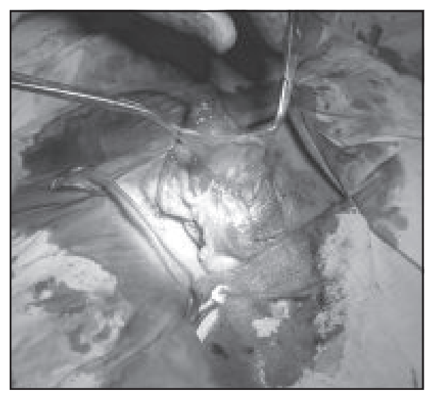
Fig.-2: Harvesting the TV flap prior to application over the neourethra.

After applying a test of significance for the major complication of urethrocutaneous fistula by Chi square test, p value was observed to be <0.01, which means that the surgical outcome of hypospadias surgery between study group (A) and control group (B) is significantly different.