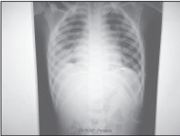
Fig.-4: Chest X-ray on first post operative day.