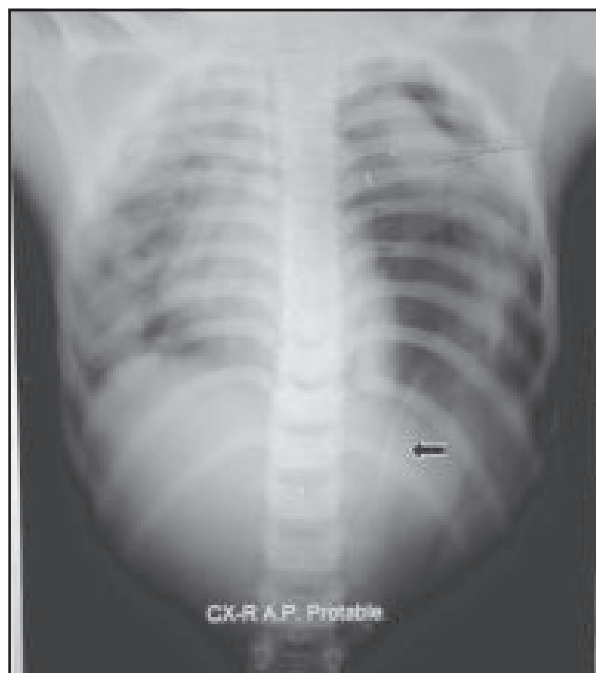
Fig.-1: Arrow showing chest drain tube in abdomen.

(Figure-3) after keeping a chest drain tube. The patient was kept in ward without ventilatory support with adequate analgesia. The patient's recovery was uneventful. Chest physiotherapy was given. Chest X-ray was done on first post operative day that showed well expanded left lung, normal elevation of the left dome of the diaphragm and return of the mediastinum to normal position (Figure-4). Drain was removed on 3 rd postoperative day. The patient recovered well and was discharged on 7 th post operative day.