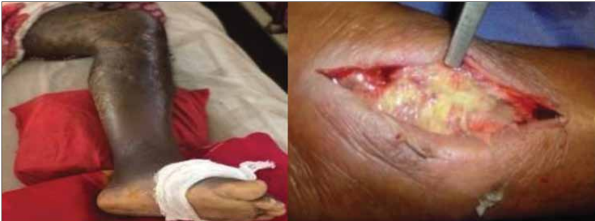
Figure-1: Cellulitis of left lower limb, deep seated pus after incision

respiratory rate 18 breaths/min mildly enlarged spleen without palpable liver or any free fluid in the abdomen, and no cardiovascular or neurological abnormalities. On local examination- the left leg is swollen, edematous, cellulitis, and with pustular discharge. Laboratory investigations showed hemoglobin- 8.49gm/dl, ESR-85mm in 1st hour, total count- 13.0K/ul, MCV- 77fl, urine R/M/E- pus cell- plenty, RBC= 3-4/HPF, Serum Creatinine- 1.2 mg/dl, Serum Electrolytes- sodium-128, potassium-4.5 mol/l, bicarbonates-normal, Chest X-ray – normal, Ultrasonography- Hepatosplenomegaly,