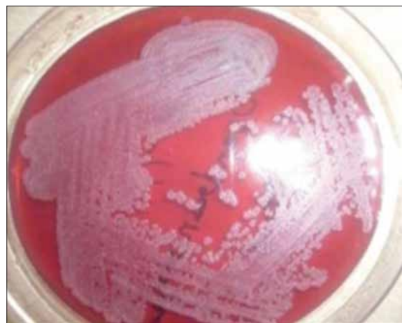
Figure-2: Colonies of Burkholderia pseudomallei on Mac Conkey agar 15

Surgery has an important role in the management of melioidosis. Drainage is required for localized pus such as big abscesses in internal organs (liver, prostate, etc. and muscles. Repeated joint aspiration and washout may be required in septic arthritis if the collection is massive. Other internal abscesses rarely need to be drained as they frequently resolve with medical therapy. Repeated surgical debridement of the necrotic bones is an essential part of managing osteomyelitis. Urgent surgical intervention is warranted if a Mycotic aneurysm is suspected. 14