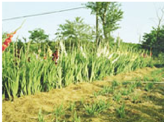
Fig: Field View at Flowering Stage of Gladiolus Flower