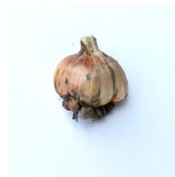
Fig:Corm of Orange Genotype