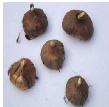
Fig: Sprouted Corm of Gladiolus