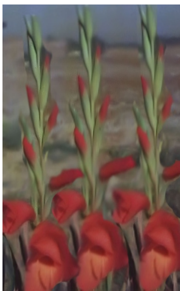
Fig: Orange Genotype