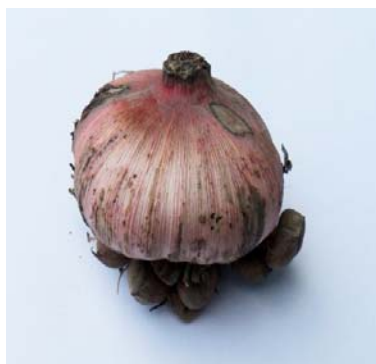
Fig:Corm of Yellow Genotype