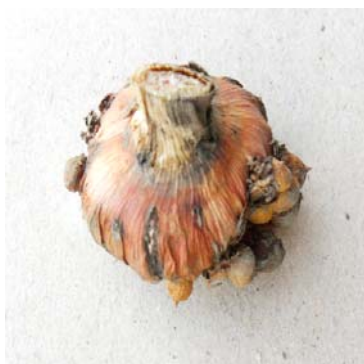
Fig: Corm of White Genotype