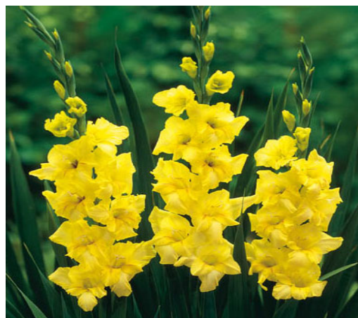
Fig: Yellow Genotype