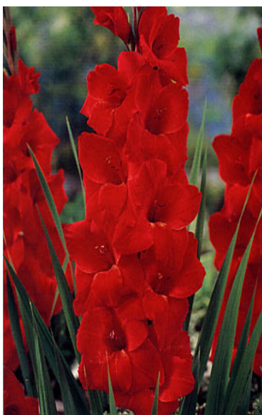
Fig: Red Genotype