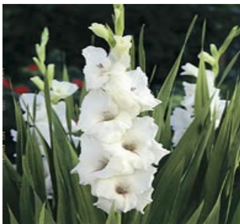
Fig: White Genotype