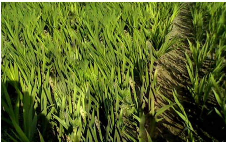
Fig: Field View at Vegetative Stage of Gladiolus Flower