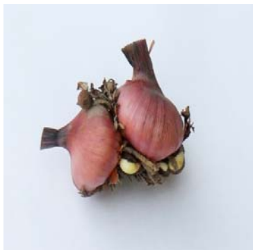
Fig:Corm of Violet Genotype