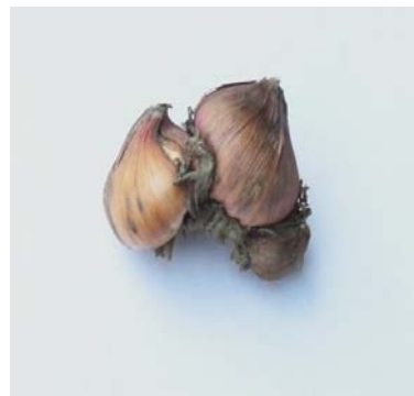
Fig:Corm of Red Genotype