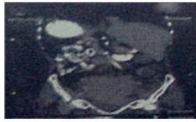
Fig-1: CT Abdomen shows well defined extra intestinal mass.