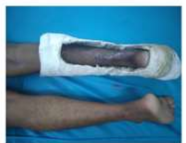
Fig. 7: Healed wound