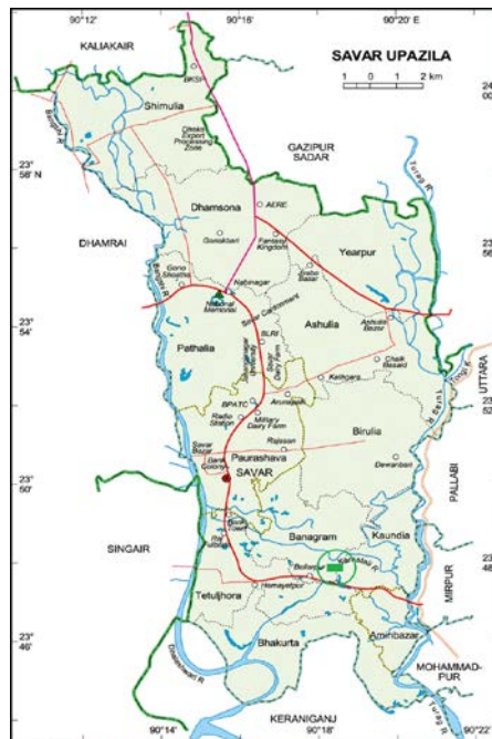
Fig. 1. Location map of the study area. The green shaded area enclosed by circle indicates the waste dumping site.

The Amin Bazar waste dumping site (23°47'48"N and 90°17'50"E), one of the main dumping sites for Dhaka city wastes, is situated within the low-lying floodplain of the River Karanachhali in Savar upazilla under the district of Dhaka alongside Dhaka-Aricha highway. The area around the dumping site is mainly used for agricultural activities and by brick manufacturing industries except during the monsoon (June-October) when the areas are inundated by rain and flood. The area is used as a dumping site from 2007. Fig. 1 shows the study area.