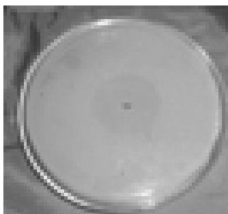
Fig. 1. Keratinolytic activity of H5 isolate.

All the isolates (H1 to H8) were screened for keratinolytic activity on the Casein agar plates. The organisms producing zone of hydrolysis Casein agar plates were considered as keratinolytic organisms. Among all, only H5 isolate showed zone of hydrolysis while other isolates didn't show any zone. The keratinolytic activity of H5 isolate is mentioned in Fig. 1. The H5 isolate produced 26 mm zone of inhibition on Casein agar plates.