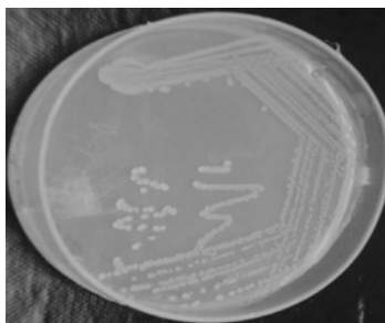
Fig. 2. Colony morphology of H5 isolate.

The colony morphology of H5 organisms is reported in Fig. 2 and Table 1. The colonies of H5 isolates were found as Large, round, irregular, mucoid, creamy white in colour, raised.