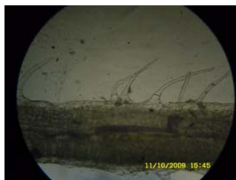
Fig. 3. Transverse section of lamina. (upper epidermis, spongy parenchyma and lower epidermis).

Lower epidermis: Single layered, elongated cell and closely arranged.