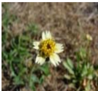
Fig. 1. Tridax procumbens .

larvae of the mosquito, Culex quinquefasciatus [2]. Alcoholic extract of aerial parts showed hepatoprotective action against acute hepatitis induced by carbon tetrachloride in albino rats; the activity has been attributed to the chloroform insoluble fraction of the ethanolic extract [3]. Alcoholic extract of the aerial parts also exhibited hair growth promoting activity in albino rats [4]. The extract of Tridax procumbens also possesses antidiabetic effect [5, 6], haemostatic activity [7], anti-inflammatory activity on wistar albino rats [8, 9], antimicrobial activity on S. aureus , P. mirabilis and E. coli [10], cardiovascular effects [11] and immunomodulatory effects [12]. Some drugs of plant origin in conventional medical practice are not pure compounds but direct extract or plant material that have been suitably prepared and standardized. Establishment of pharmacognostic profile of the leaves of Tridax procumbens will assist in standardization, which can guarantee quality, purity and identification of samples.