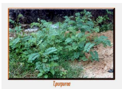
Ph-1. Morphological characters of Tephrosia purpurea .

Tephrosia purpurea Linn. commonly known as Wild indigo or Galegu purpurea , belongs to family Leguminosae (subfamily-Papilionaceae) (see Ph-1). In Hindi it is called Sarphonka or Dhamasia and in Sanskrit it is called Sharapunkha. It is distributed throughout the tropics and sub-tropics and has been introduced elsewhere for green manure and soil conservation. It is highly branched sub erect herbaceous perennial herb usually 30-60 cm in high; with thin firm glabrous branches. Leaves are 6.5-12.5cm long, short petiolated, with 13-14 narrowly oblanceolate leaflets, green and glabrescent above and obscurely silky beneath. Flowers-red or purple, pods slightly recurved, pedicels short and bracteoles minute [6].