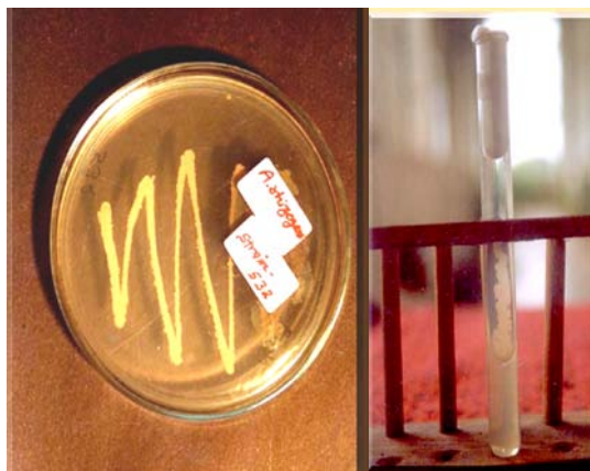
Ph-2. Culture of Agrobacterium rhizogenes (strain 532).

As per requirement, the temperature of bacterial culture was maintained at 26°C. The culture was sub-cultured at regular intervals of 30 days.