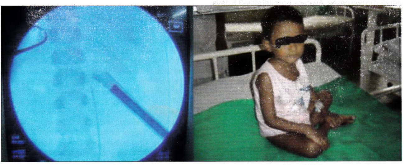
Complete clearance of stone