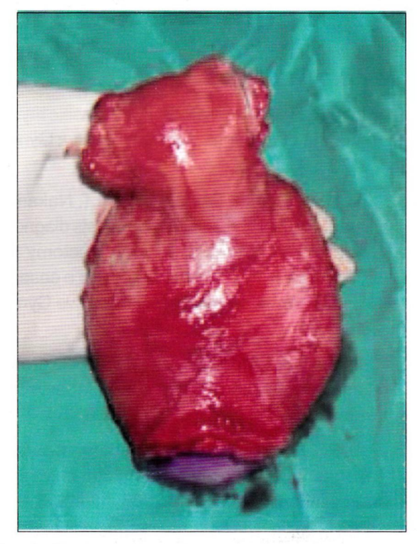
Fig.-2: Excised parasitic myoma