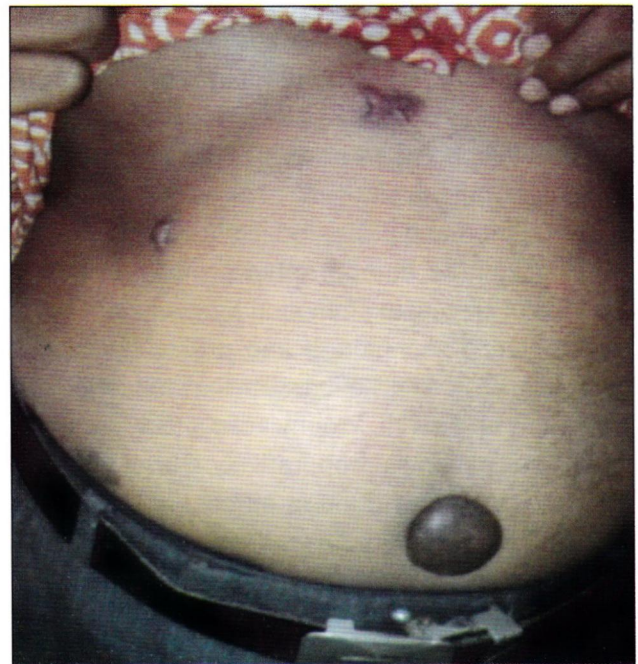
Fig.-3: Port site keloid