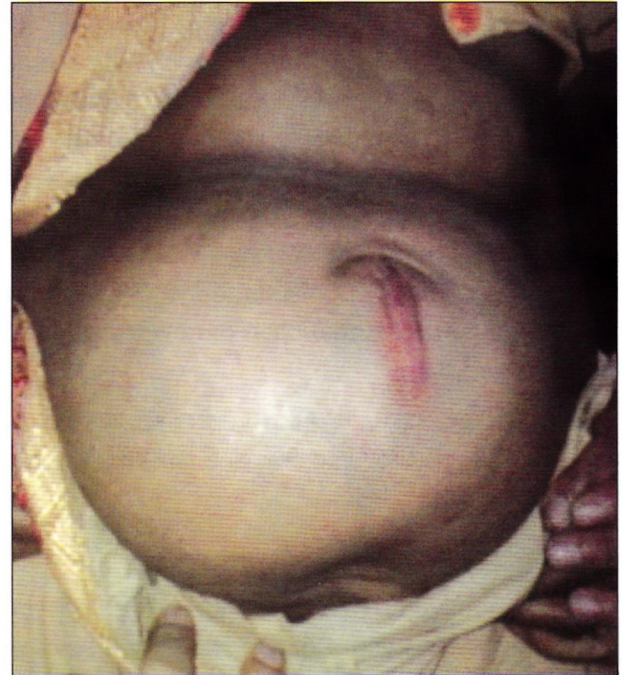
Fig.2: Port Hernia

in 6(.63%) cases and one (0.1%) case respectively (figure 2 & 3) in this series mortality was quiet low with only 2 cases (0.21%) cases, both being males and had bile duct injury with subsequent biliary peritonitis and died possibly due to septic shock. 641 patients reported for follow up after one week while the rest were lost to follow up.