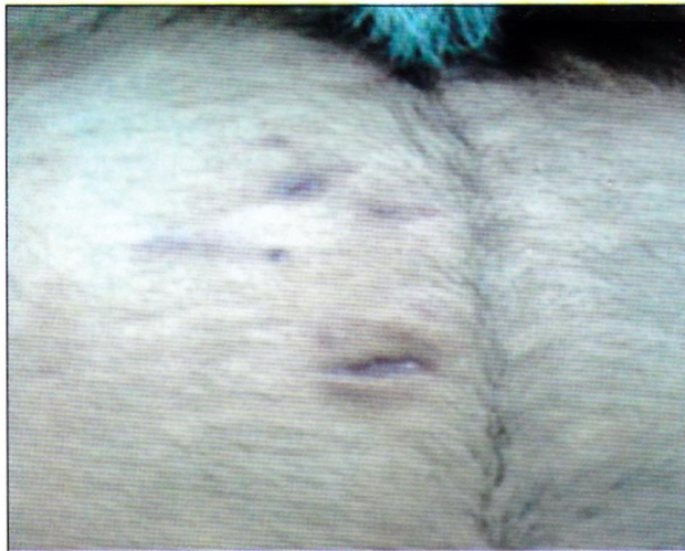
Fig.-4: Port site infection( tubercular)