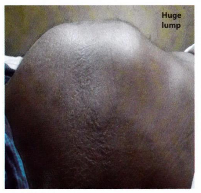
Figure1 : Huge abdominal lump

Case Report: A 51 year old male presented with rapidly growing lump in the central abdomen for 3 months, dull aching central abdominal pain for 2 months, significant weight loss (5kg) within last 2 months.(Fig 1)