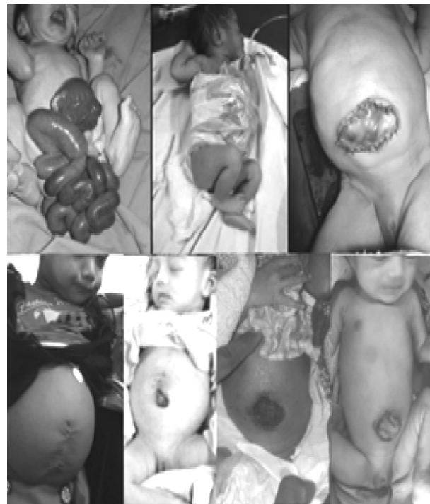
Fig-3: Serial photographs of a patient with gastroschisis (clockwise)- at the time of admission, after plastic sheet wrapping, use of umbilical cord flap as covering, 7th POD, 15th POD, After 1 month, at the age of 2 years.