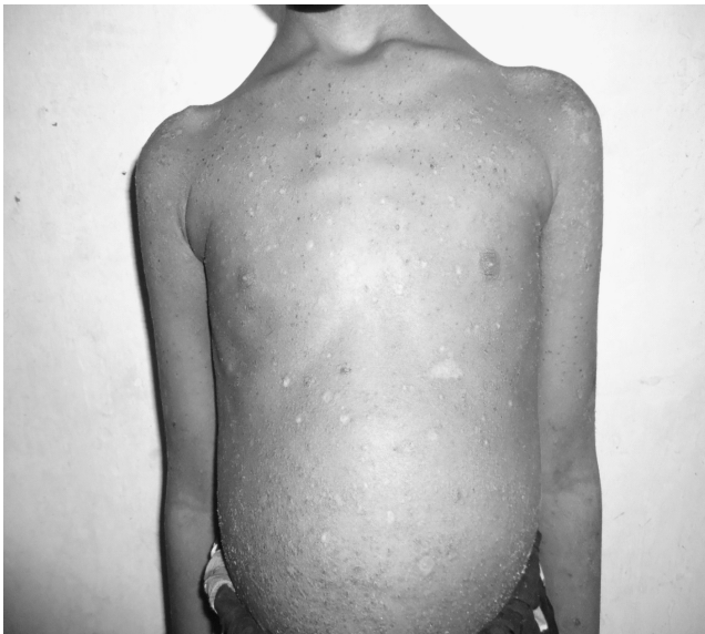
Figure I: Distended abdomen with skin changes

mixed with mucous without blood. The loose motion was not associated with abdominal pain, cramp or vomiting. Most often the loose motion subsided spontaneously and sometimes with medication. Rashes were erythematous and itchy. The swelling first appeared in the leg and subsequently involved face and abdomen. The patient had no history of fever, jaundice, haematuria, dysuria, respiratory distress and effort intolerance during this period of illness. The patient had good appetite and her diet was adequate. Her face was puffy and was moderately pale and had generalized oedema.