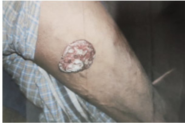
Fig-1: Showing a mass in the right leg with central ulceration

His laboratory investigations including complete blood count, random blood sugar, renal function tests, liver function tests, chest X-ray and ECG were within normal limits. FNAC of inguinal lymph nodes showed reactive changes.