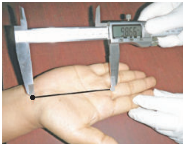
Figure – 2 : Photograph showing the measurement of palmar length by using digital sliding calipers. ● Black dot = Midpoint of distal transverse wrist crease; ● Gray dot = Midpoint of metacarpophalangeal joint crease of middle finger and — Black line = Palm length

Right hand showed non significant positive correlation with average hand grip strength and body mass index (BMI) in both nonproduction ( r= +0.039 , P>0.05 ) and production ( r= +0.069 , P>0.05 ) related garment workers group (table-I, Fig-5). Left hand showed non significant positive correlation with average hand grip strength and body mass index in nonproduction ( r= +0.071 , P>0.05 ) related garment workers group but significant positive correlation was observed in production ( r= +0.266 , P<0.01 ) related garment workers group (Fig-5).