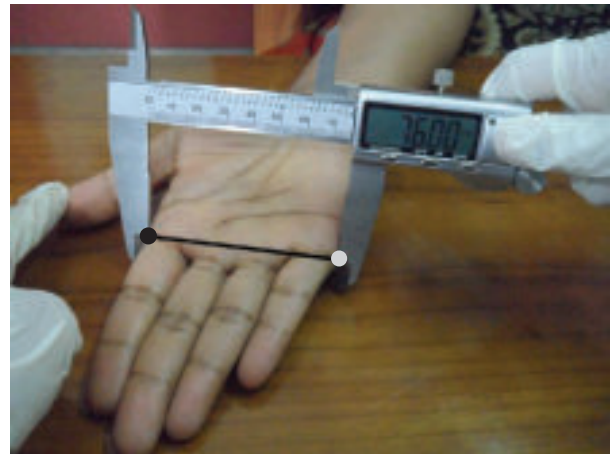
Figure - 3: Photograph showing the measurement of hand breadth by using digital sliding calipers. ● Black dot = Radial side of second metacarpophalangeal joint; ● Gray dot = Ulnar side of fifth meta-carpophalangeal joint and — Black line = Hand breadth

It was observed that the right hand showed significant positive correlation with average hand grip strength and length of palm in nonproduction ( r= +0.259 , P<0.01 ) related garment workers group, but production ( r= +0.164 , P>0.05 ) related garment workers group showed no significant