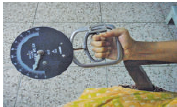
Figure-4: Photograph showing the procedure for measuring hand grip strength

positive relationship (table-I). Left hand showed non significant positive correlation with average hand grip strength and length of palm in nonproduction ( r= +0.124 , P>0.05 ) related garment workers group but significant positive correlation was observed in production ( r= +0.264 , P<0.01 ) related garment workers group.