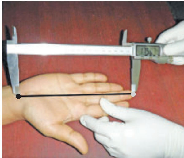
Figure - 1 : Photograph showing the measurement of hand length by using digital sliding calipers. ● Black dot = Midpoint of distal transverse wrist crease; ● Gray dot = Most distal point at tip of middle finger and — Black line = Hand length

Right hand showed non significant positive correlation with average hand grip strength and body mass index (BMI) in both nonproduction ( r= +0.039 , P>0.05 ) and production ( r= +0.069 , P>0.05 ) related garment workers group (table-I, Fig-5). Left hand showed non significant positive correlation with average hand grip strength and body mass index in nonproduction ( r= +0.071 , P>0.05 ) related garment workers group but significant positive correlation was observed in production ( r= +0.266 , P<0.01 ) related garment workers group (Fig-5).