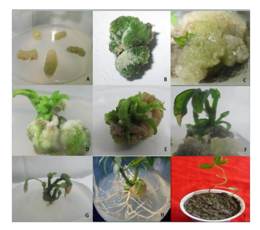
Fig. 2. Shoot organogenesis from cotyledonary node explants of BARI Mash 2, A) Callus initiation after seven days of incubation, B) Callus after one month of initiation, C-F) Multiple shooting, G) Shoot on root medium, H) Shoot forming roots and I) Acclimatized plant in the soil

the average shoot length was highest (Table 2). Different combinations of BAP combined with NAA were also used in regeneration medium. It is clear that the response was lower when two hormones were used together rather than BAP alone. But at high BAP and low NAA concentration, the highest percentage of shoots was obtained. Result obtained from this experiment is shown in Table 2. A positive effect of low concentration of cytokinin on multiple shoot regeneration was also observed in other legume, such as V. raditata (Chandra & Pal, 1995; cowpea ( V. unguiculata Muthukumar et al. , 1996), chickpea ( Cicer aritenum ) (Chakraborti et al. , 2006; Das et al. , 2016) grass pea ( Lathyrus sativus ) (Saha et al. , 2015), black gram (Periyakaruppiah et al. , 2016).