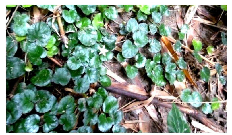
Fig. 1. Geophila repens in a natural habitat