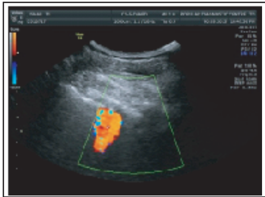
Figure 3: Turbulence of Injectate in color Doppler mode.