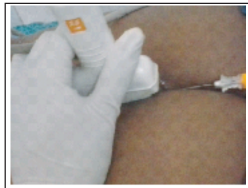
Figure 1: Caudal epidural needle Placement

<0.05 was considered statistically significant at 95% confidence Interval. Before conduction of the procedure, patient's medical and imaging records were carefully reviewed. Obtaining an informed consent, the procedure was performed with strict aseptic precautions and intra-procedural vital parameters were monitored. A high resolution ultrasound GE Healthcare Volusion E8 (USA) with 12mhz probe was used to detect tip of 22 gauge spinal needle real time placement (Fig-1). 10 cc was injected (80 mg methyl prednisolone: normal saline-1:4) was given through sacral hiatus after piercing sacrococcygeal ligament. When the Physiatrist was satisfied that the needle was penetrated through the sacral hiatus into sacral epidural space, another 7 MHz probe was placed between 2 nd and 3 rd lumbar vertebrae to observe the turbulence of the injected material was observed in the lumbar epidural space. (Fig-3) Patients were monitored for one hour in the Popular Medical College Hospital. Patients were followed up at 2 nd day, 7 th day, 14 th day and 28 th day. After Caudal epidural steroid, patient was advised to do absolute bed rest for one day then, gradual return to active life with maintaining Activities of Daily Living (ADL), Back muscle strengthening exercise.