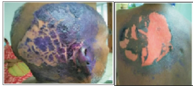
Figure 3 & 4: skin lesion over Scalp and back.