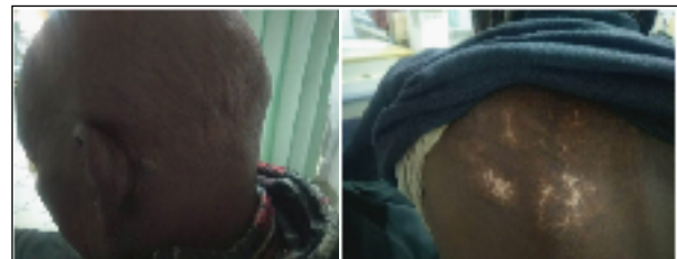
Figure 5 & 6: skin lesion over Scalp & back after treatment