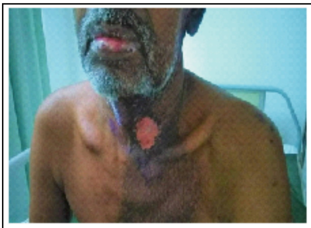
Figure 1: skin lesion over anterior neck