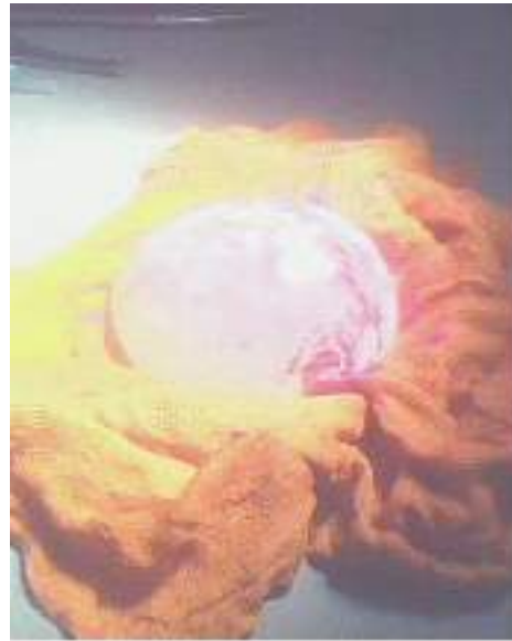
Enucleated specimen of Hydatid Cyst

was transferred to ICU at 11.30 am. with stable haemodynamic status with no inotropic support.