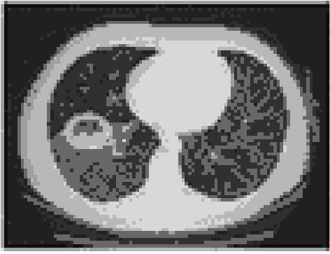
CT Scan of the chest

The CXR showed a central hilar vascular prominence, well defined, almost oval shaped, well margined homogeneous opacity noted in right mid zone. Then he was advised to do a CT scan of the chest. The CT scan of the chest showed right sided cystic lesion possibilities of Hydatid cyst. Then he was referred to the department of Cardiothoracic surgery. He had no significant past history of illness. He was normotensive, non-smoker and non-diabetic and bowel and bladder habit was also normal. He had no hepatosplenomegally. Other organs were normal. His other relevant investigations were within normal limit. He underwent total enucleation of the cyst through right posterolateral serratus anterior saving thoracotomy through the 5th, intercostal spaced, on 10.01.2013. His diagnosis was confirmed by histopathology report. His recovery from the operation was uneventful. After discharge he attended in OPD after 15 days. His CXR and other relevant investigations were normal.