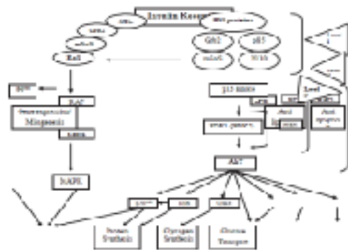
Figure-II: Insulin receptor, components of the mitogen activated (MAP) kinase and phosphatidylinositol 3 kinase (p13-K) signaling pathways, and insulin actions 42 [Adapted from Diab Care 24: 2001] IRS

proteins also contain a PTB (phosphate tyrosine binding) domain COOH-terminal to their PH domain which recognizes the phosphotyrosine in the amino acid sequence asparagine-protein-anyamino acid-phosphotyrosine (NPXPY). The PTB domain which is present in a number of signaling molecules 10 shares 75% sequence identity between IRS-1 and IRS-2 and functions as a binding site to the NPXY amino acid motif of the juxtamembrane region of the insulin receptor to promote IR/IRS-1 interactions. The COOH-terminal region of IRS proteins contains multiple tyrosine phosphorylation motifs that serve as docking sites for proteins which mediate the metabolic and growth promoting functions of insulin.