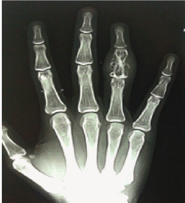
Fig-2: Pre-operative radiograph

A radiograph of right hand showed an expansile lytic lesion in the middle phalanx of ring finger. The margins were well defined with internal septations and associated cortical sclerosis. There was cortical destruction present.