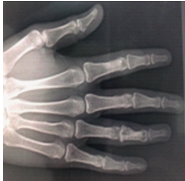
Fig-4: Post-operative radiograph after 2 years