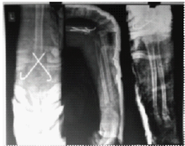
Figure-2: (Post-Operative Radiography)