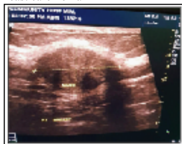
Figure 2: Fibroadenoma of breast