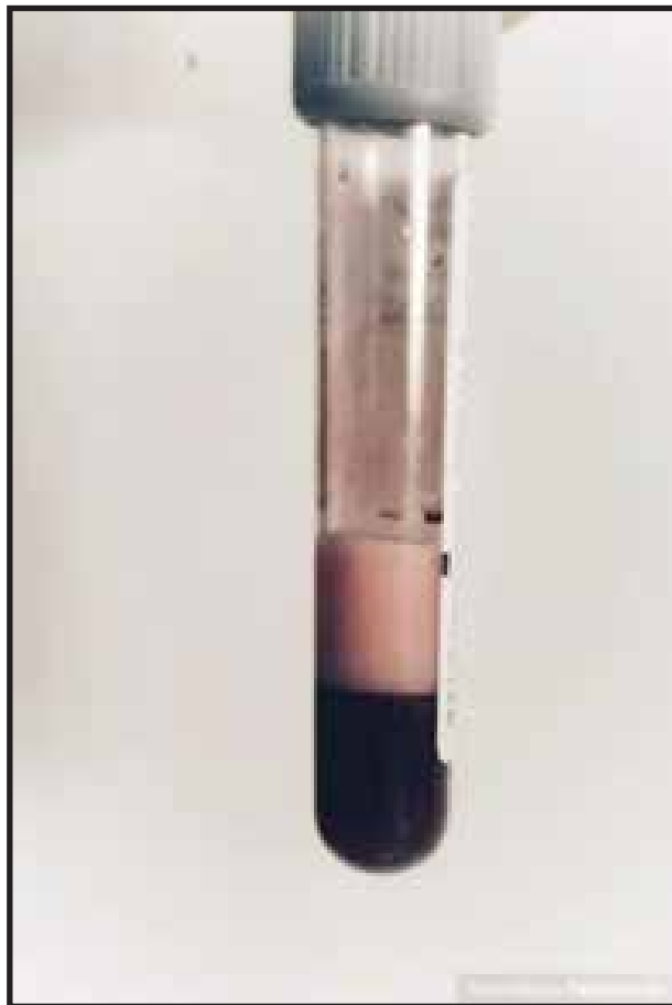
Figure - 1

Among all the reports marked abnormality was found on Triglyceride (TG) report which was 2705mg/dl. As patient has no jaundice or any feature of coagulopathy we started treatment of very severe HTG (>2000mg/dl) by keeping the child NPO with 10% Baby saline with Inj. Insulin with 0.1 unit/kg over 72 hours and monitored serum TG level after 3 days. There was dramatic response as it lowered to 396 mg/dl. Then we allowed oral feeding with low fat milk along with breast feeding and Gemfibrozil and Omega-3 fatty acid were added.