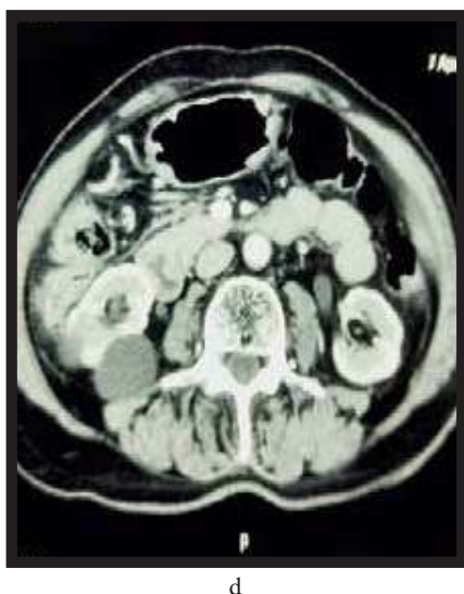
Figure - 'd' shows cross section of abdominal CT where arrow-mark shows sub-serosal gas/air.