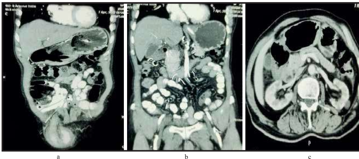
Figure - a,b,c shows abdominal CT scan with soft tissue thickening in arrow mark.

coagulation profile were found normal. His vomiting did not completely subside even after having conservative treatment. Then he was planned for gastro-jejunostomy according to clinical state and CT scan findings. Gastro-jejunostomy was performed using linear cutter stapler. On the 2 nd postoperative day he got blood loss through NG tube. He also developed fever with increased WBC count. Then antibiotic was changed, blood transfusion and cold normal saline wash was given through NG tube. The sepsis was improved but blood loss through NG tube did not improve till the 5 th postoperative day. Then planning was taken for re-laparotomy. During 2 nd laparotomy there was no apparent external bleeding at anastomotic site rather seems to be internal bleeding inside the stomach. Then distal gastrectomy including the previous anastomosis site was done. A roux-en-Y gastro-jejunostomy was performed. The post-operative period was un-eventful. Histo-pathology of distal stomach and gastro-jejunostomy site was reported as pneumatosis cystoides intestinalis (PCI) with parietal cell hyperplasia of the stomach.