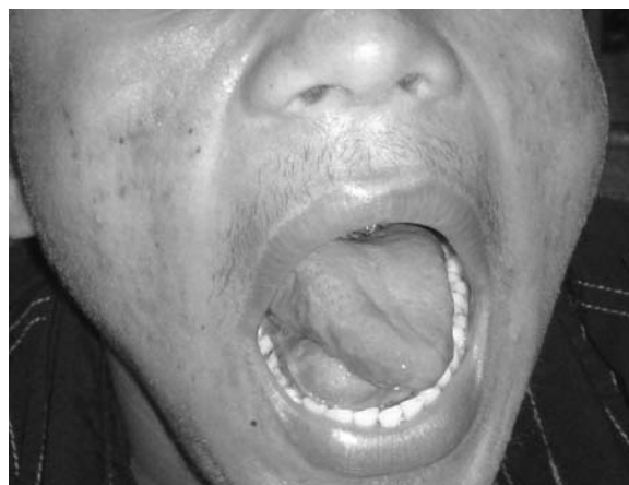
Fig. 1: Peroral View

A ranula by definition is a mucus filled cavity, a mucocele, in the floor of the mouth in relation to the sublingual gland 1,2 . The name "ranula" has been derived from the Latin word "rana" means "frog" "ula" means little, which means little frog. The swelling resembles a frog's translucent