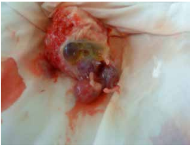
Fig. III Excise gestational sac with living foetus