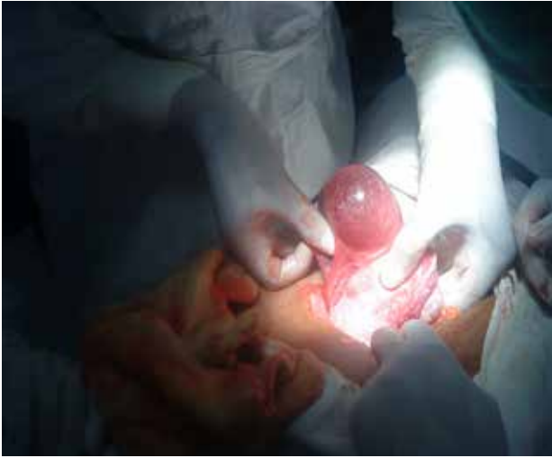
Fig. II: Angular gestational sac