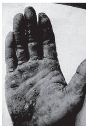
Figure-5: Moderate Keratosis.