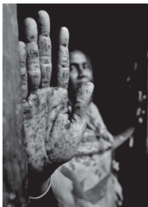
Figure-4: Mild Keratosis.

depending on the extent and severity 15 . In the mild variety of keratosis, the involved skin has hardened texture with papules less than 2 mm in size [Fig-4] that can be best felt by palpation. In the moderate variety, the lesions usually advance to form raised, punctate, keratosis, 2-5 mm in diameter [Fig-5]. When the keratosis becomes severe, it may form keratotic elevations more than 5 mm in size and sometimes become confluent and diffuse and sometimes result in cracks and fissures too 34,39 [Fig-6].