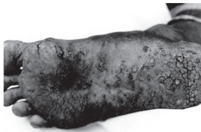
Figure-6: Severe Keratosis with crack and fissure.

Though palms and soles are primarily affected by hyperkeratosis, dorsa of the extremities and trunk may also be affected by it. It is interesting that palmar keratosis usually appears earlier than arsenic-related cancers of bladder and lung; thus it can act as an early marker of carcinogenicity 40 .