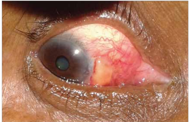
Figure-5: A case of post-operative graft retraction reported in group 1.