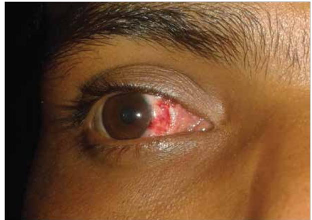
Figure-4: A case of post-operative graft retraction reported in group 1.

Conjunctival edema (Fig-5) occurred in 5 eyes (6.6%) in group 1 and in 4 eyes (4%) in group 2. Most cases of conjunctival edema resolved gradually within the first post-operative week. Conjunctival granuloma (Fig-6) occurred only in group 2 in three eyes (3%), all of them treated by surgical excision within the first post-operative month. Conjunctival cyst occurred in one eye (1%) in group 2 and dellen occurred in two eye (2%) in group 2. There are no anesthetic complications, graft necrosis, symblepharon, scleral necrosis or thinning, excessive bleeding, globe perforation or injury to medial rectus in all of patient groups.