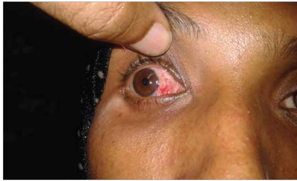
Figure-3: A case of post-operative conventional sutured conjunctival limbal autograft by Nylon 10/0.

Table II presents the main and secondary postoperative outcomes. The recurrence rate was 1.3 % (1 eyes) in group 1. Recurrence in group 1 occurred after 3 months. The recurrence rate was 2 % (2 eyes) in group 2. All cases of recurrence in group 2 occurred after 6 months. Graft dehiscence occurred in 1.3% (1 eyes) in group 1 and there were no cases of graft dehiscence in group 2. It occurred following vigorous rubbing of the eye on the 6th postoperative day. Patient was treated by suturing the same graft with (10/0 nylon sutures).