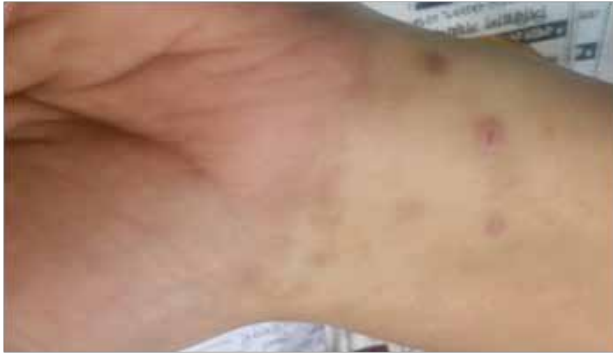
Figure-2: LP lesions in wrist and forearm.

Her physical appearance was compatible with that of DS and following features were observed: epicanthic fold, brachicephaly and depressed nasal bridge, upward angle of eyes, short broad neck and widened hands and foot and shortening of 4 (four) lateral toes. Routine laboratory data were between normal ranges. Her liver and kidney function parameter were within normal range. Histopathological study revealed hyperkeratosis, hypergranulosis, vacuolar degeneration of basal layer of epidermis and inflammatory cell infiltrate in upper dermis [Fig:3,4]. These findings are compatible with lichen planus. Her lipid profile was within normal limit. An interview with her family revealed that she had learning disability otherwise she was psychologically sound; She had only one brother and nobody of her family members had any relevant clinical conditions.