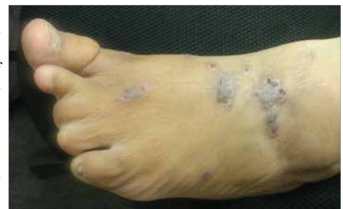
Figure-1: LP lesions in feet.

The lesions were slightly hypertrophic and signs of scratching were seen. However, lesions in wrist [Fig-2] and trunk were smaller in size. She complained of severe itching. Her treatment history revealed that she was prescribed both topical and systemic steroid several times with partial outcomes and recurrences.